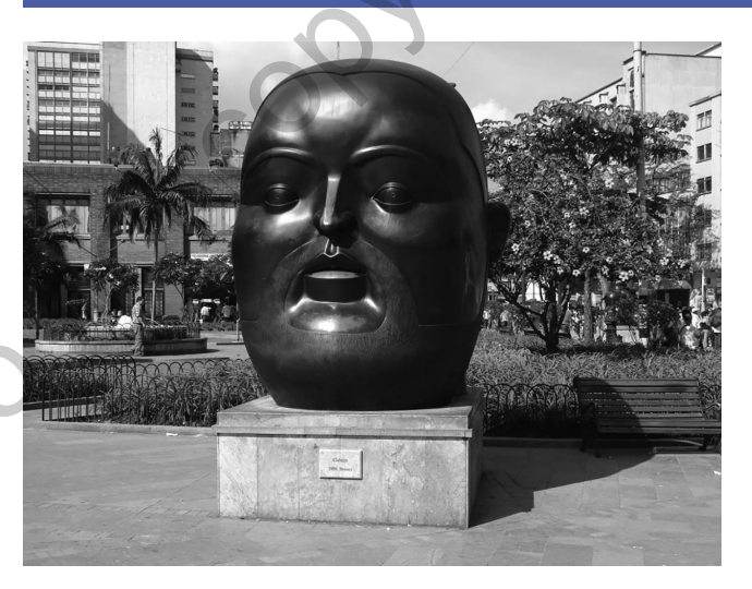
FIGURE 1.2 Colombia Presentation Sample 2

The colors represent Loyalty, vigilance and victory