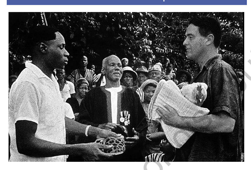
FIGURE 1.3 Colombia Presentation Sample 3

Maikel's selected image could also be read through the lens of a white person approaching Indigenous and Black Colombians to help them and the native-born people presenting gifts and other signs of peace and welcome. This image could be viewed as replicating the colonialist projects of white Europeans across the globe. This image and its range of potential interpretations could be a topic for further exploration in a curriculum, for example, drawing on ideas discussed in Chapter 5 on racial literacy.