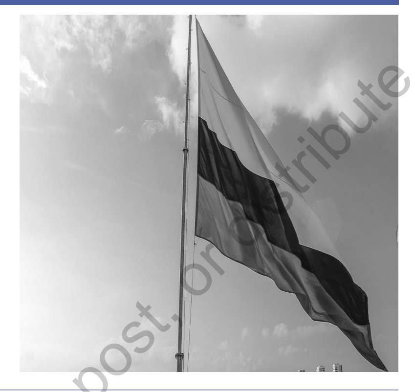
FIGURE 1.1 Maikel's Colombia Presentation